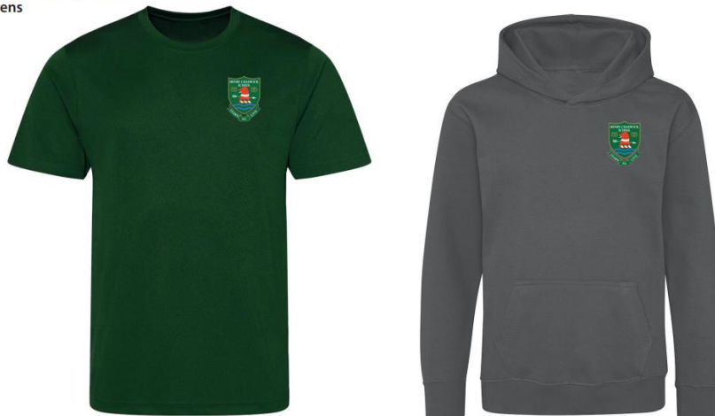
Henry Chadwick Uniforms Childrens

The expectation would be for all children to wear this uniform during their PE sessions, and for all children to come to school on PE days dressed in their PE uniform - this will include swimming lessons where the children will travel to the lessons in their PE kit - as well as to external events when representing the school. For the initial purchase there will be no cost to parents - for subsequent purchases parents will be able to purchase replacement items the same as other uniform requirements. The coloured, house t-shirts will no longer be required for PE in school.